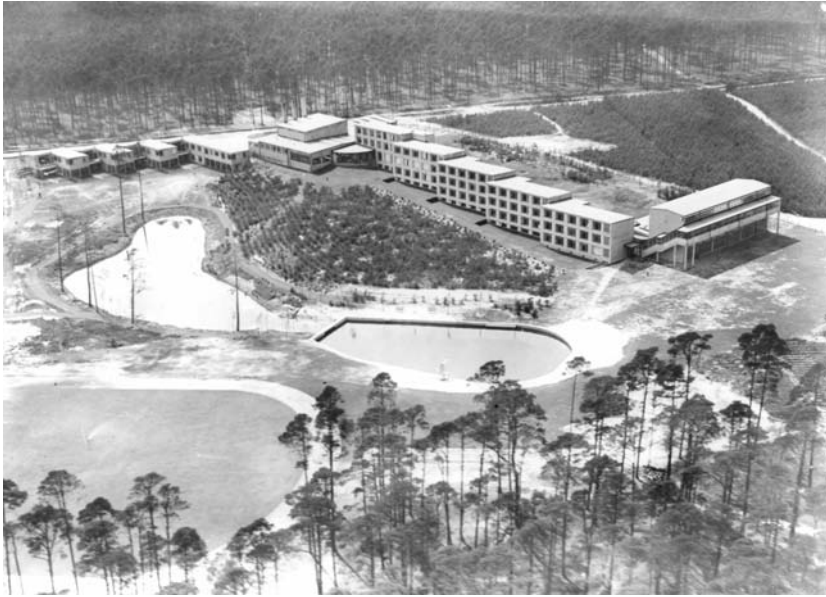
depicted item: aerial view date: 1931