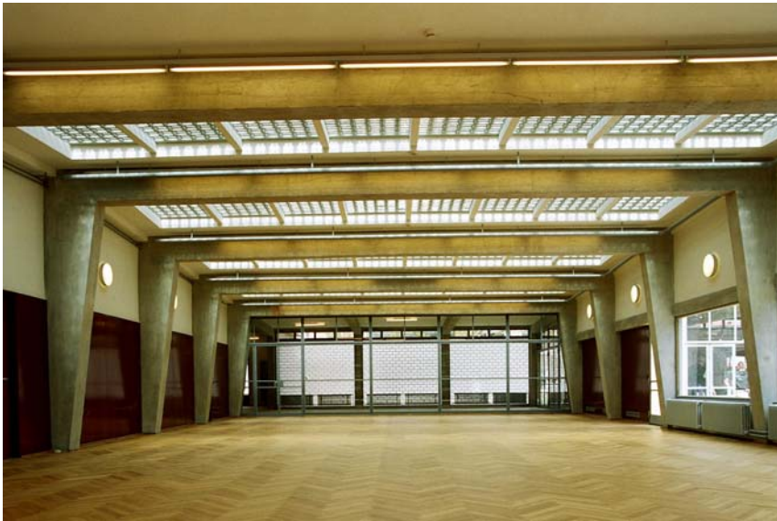
depicted item: refectory source: Winfried Brenne architects date: 2007