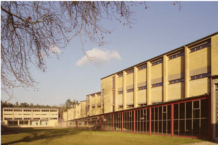
depicted item: students houses source: Winfried Brenne architects date: 2007