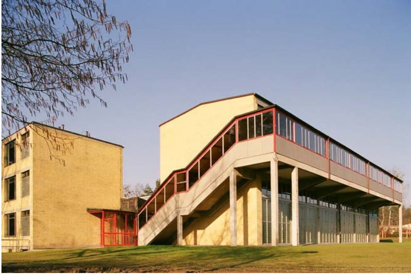
depicted item: school building date: 2007