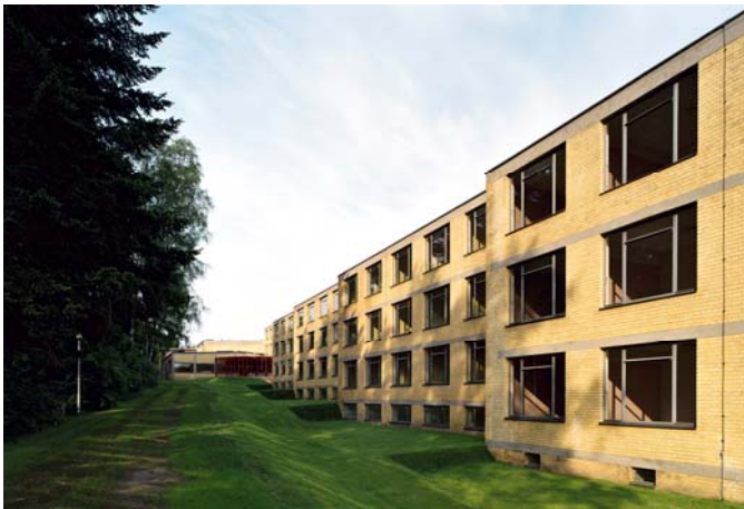
depicted item: ADGB School, students houses source: Winfried Brenne architects date: 2007