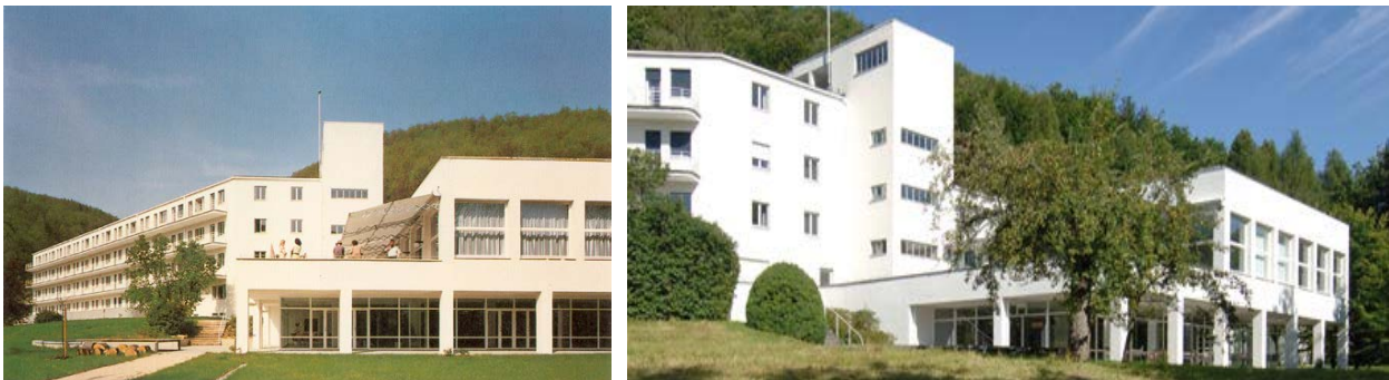
depicted item: Urach, Haus auf der Alb, dorm wing and terrace from north-east and stair tower and housekeeping and administrative building from north-east date: 2008