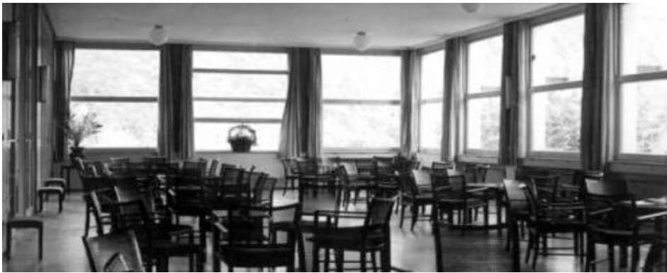
depicted item: Urach, Haus auf der Alb, recreation room date: 1930