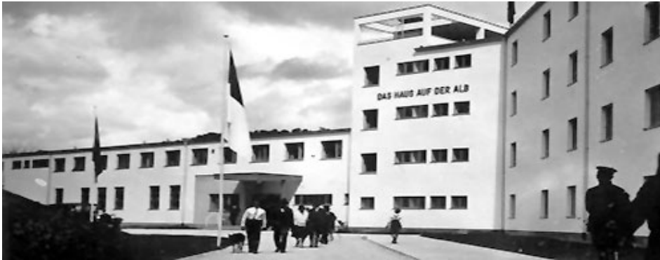
depicted item: Urach, Haus auf der Alb, view southwest date: 1930