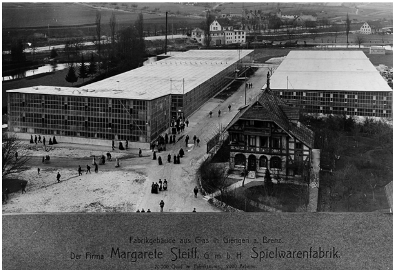
Depicted item: Steiff Factory