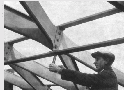
Patent: Hugo Junkers auf Basis des Systems von Friedrich Zollinger hier: Montage des modularen Stahllamellensystems, welches auch für Garagen, Flugzeughangars, Sportbauten und Bahnhöfe in alle Welt von hier aus exportiert wurde