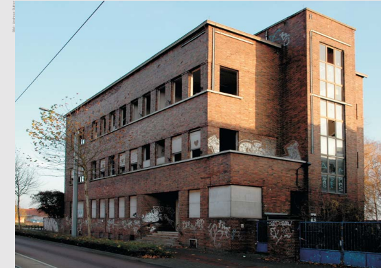
Verwaltungsbau, heute in sanierungsbedürftigem Zustand Office building, today in need of restoration

Hugo Junkers ist als Pionier im Flugzeugbau und als innovativer Unternehmer bekannt. Die Bauten der Junkerswerke sind bedeutende Meilensteine für die Dessauer Stadtgeschichte und für die Industriegeschichte in Deutschland. Die 1927 hier konzipierte und erstmalig gebaute modulare Stahl-Lamellenhalle und der 1934-36 entstandene, moderne Verwaltungsbau in Stahlskelettbauweise mit Backsteinfassade sind einmalige Dokumente für das Wirken von Hugo Junkers und für einen wichtigen Teil der hier vor Ort noch original und authentisch erhaltenen Industriegeschichte.