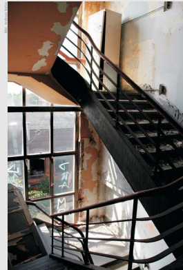
Treppenhause, heute in sanierungsbedürftigem Zustand Stairwell, today in need of restoration