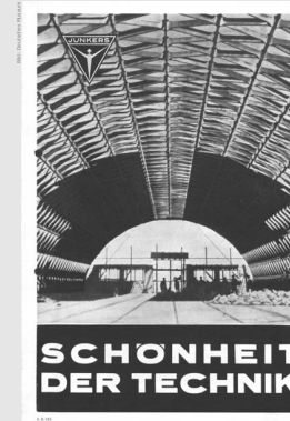
Junkers - Werbeplakat im Zeitgeist der 1920-er Jahre, zeigt ein bauzeitliches Bild der Stahl-Lamellenhalle. Die Halle ist heute jedoch in sanierungsbedürftigem Zustand.