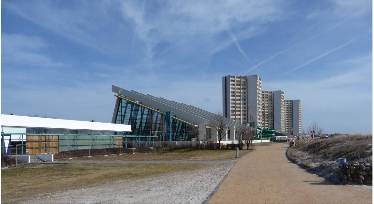
depicted item: Health Resort date: 2003