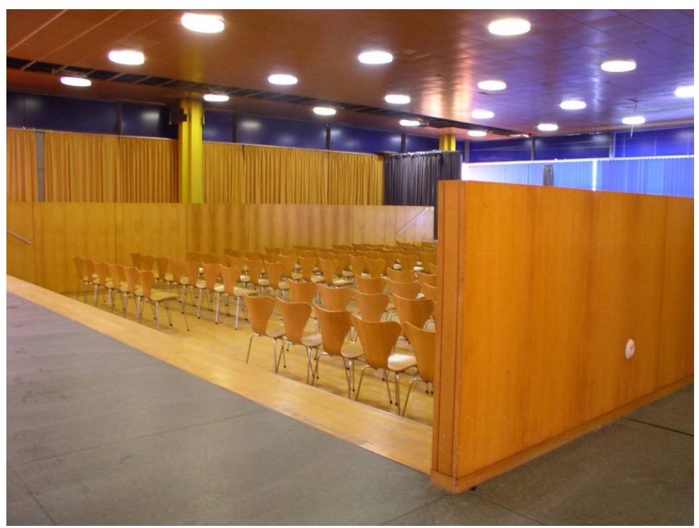
depicted item: interior of the guesthouse of the health resort date: 2003

depicted item: wave pool, guesthouse of the health resort, wellness and therapy centre date: 1970