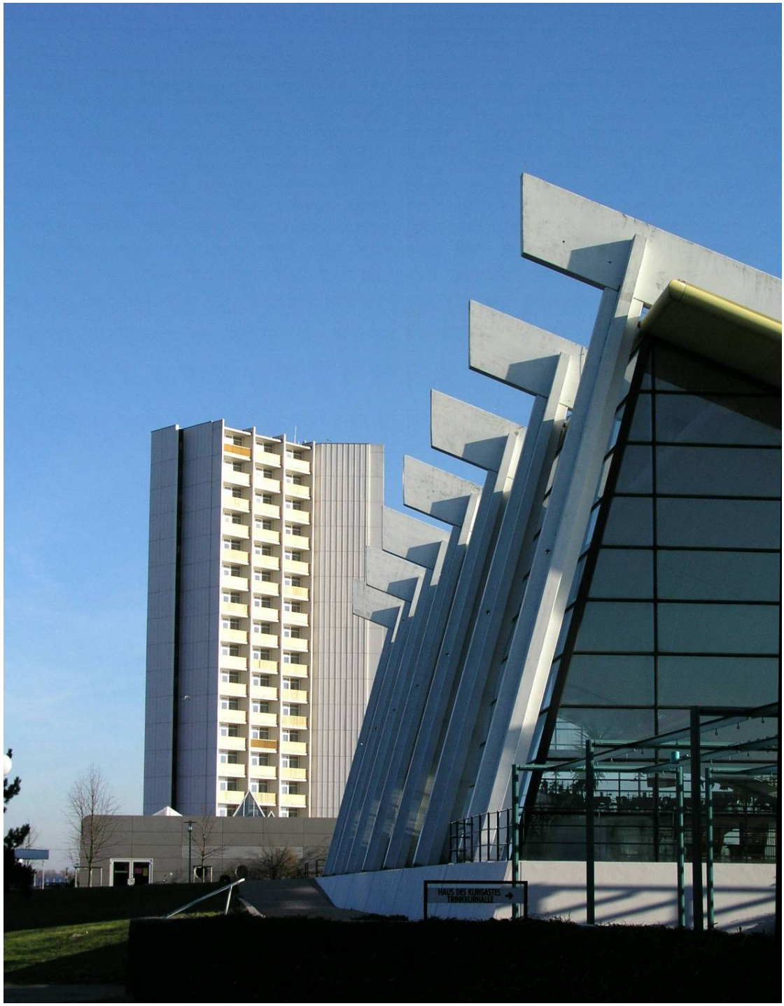
depicted item: Wave pool and apartment towers date: 2003